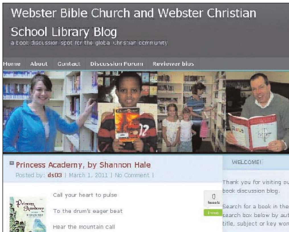
A screen shot from the blog. Check it out today!

1-7 Senior Trip 4-6 NYS English Standardized Testing (3rd-8th) 5 National Day of Prayer (9th-12th) 5-11 NYS English Standardized Testing (3rd-8th) absentee dates 9-13 Stanford Achievement Testing (K-2nd) 11-18 NYS Math Standardized Testing (3rd-8th) 12-18 NYS Standardized Testing (3rd-8th) absentee dates 13 Fun Run 20 4th Quarter Midterm Grades Go Home (6th-12th) Junior/Senior Banquet 24 Elementary Spring Concert 27,30 No School, Memorial Day