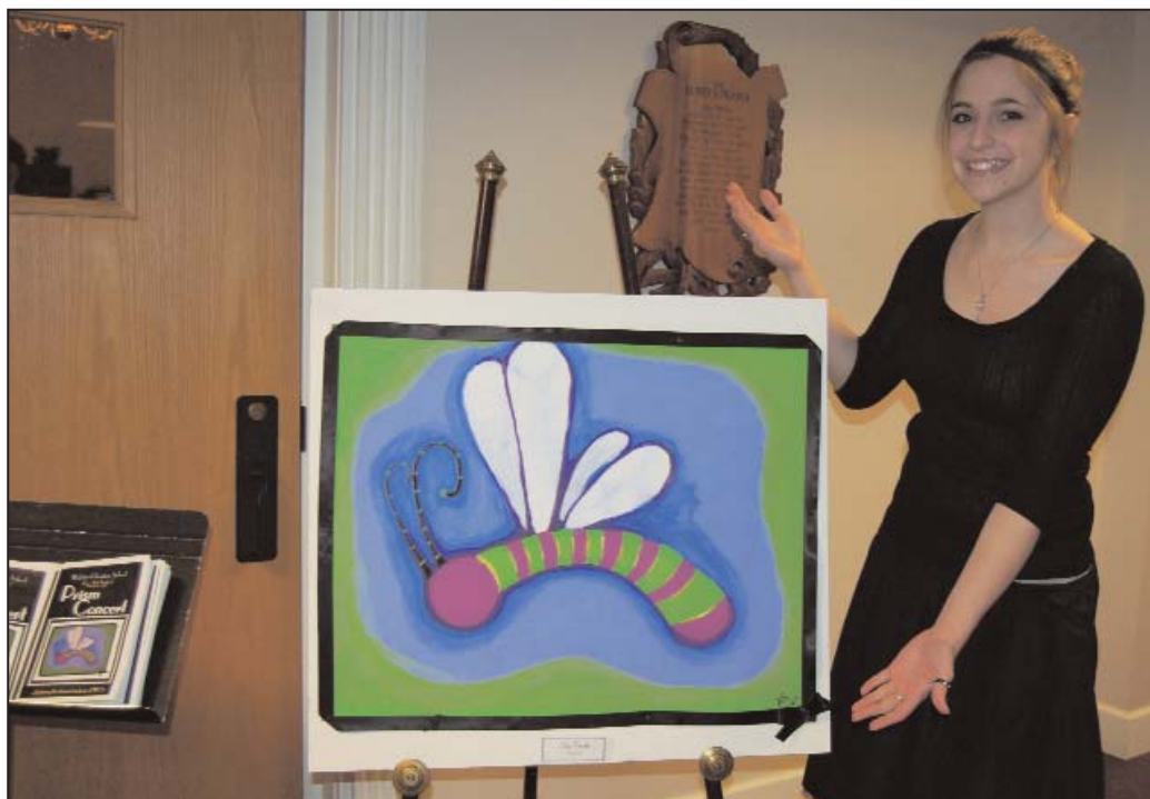
Middle and Bottom: Some of the artwork middle schoolers and high schoolers displayed. Artwork by students in kindergarten through twelfth grade was displayed at the Fine Arts Festival.